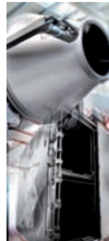
AUTOLINES: TWINLINE & COOKLINE

The stars are re-born: spray injection and marinating reinvented.