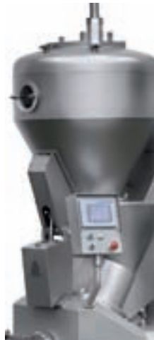
TWINVAC: COMPACTING & PRECISION

"Turn-key" RFID solutions for the meat industry.